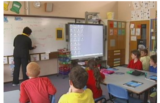
PHOTO: The report found principals experience violence at work at a rate seven times higher than the general population.

"We are expected to be everything to everyone. We have to deal with various administration, we've got to be technical leaders, cultural leaders, educational leaders, human leaders, and also do so in a symbolic manner, but make sure that we are the face of our schools and there's very complicated aspects of what we do at various times and it can be an